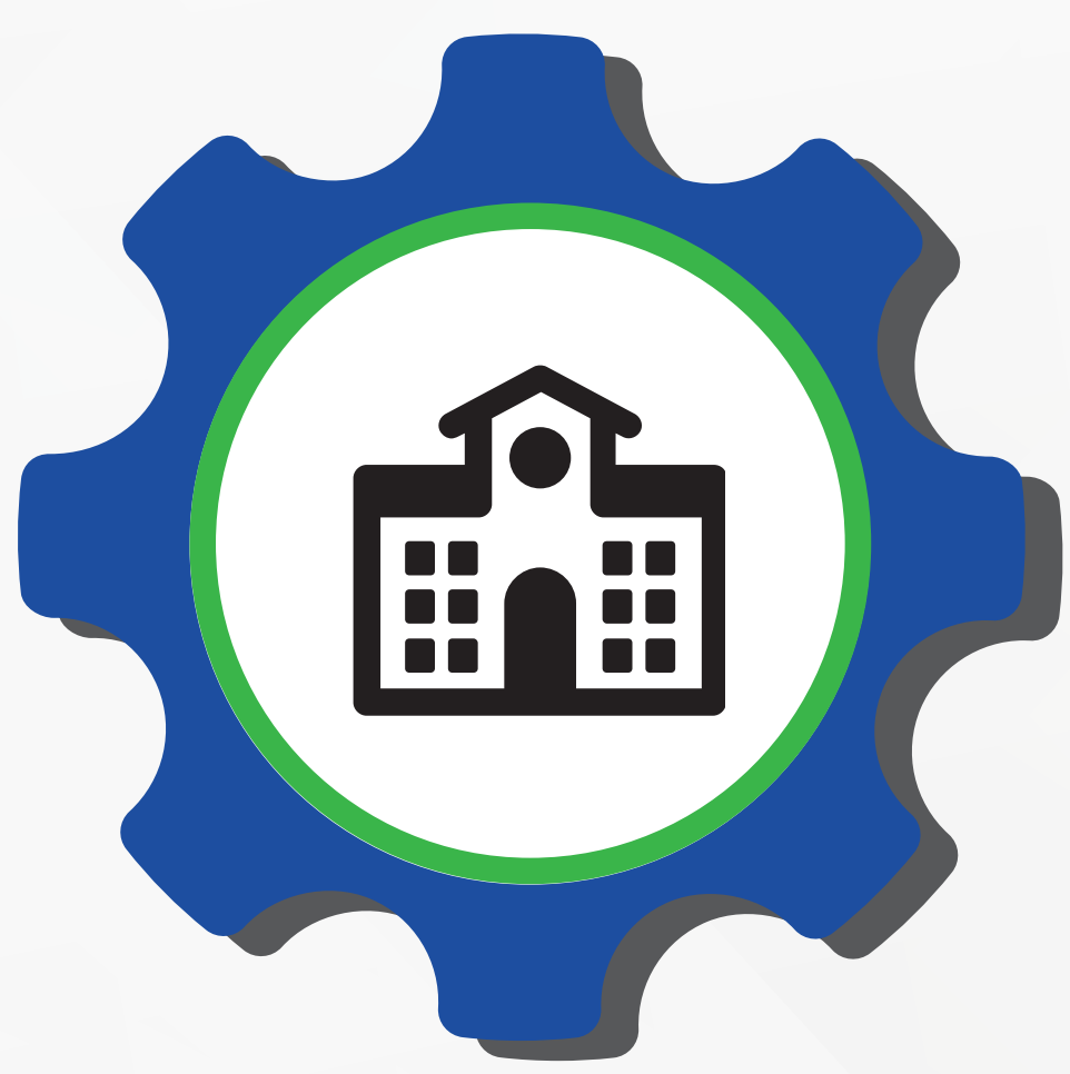
TRAINING CENTRES IN WELDING